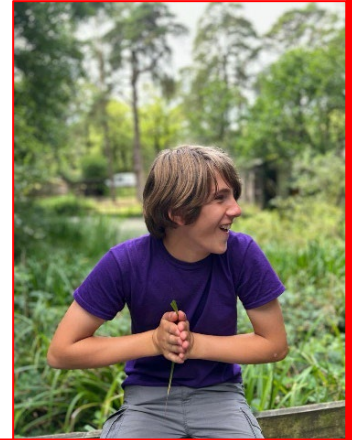
At last night's international campfire 1st Weybridge's